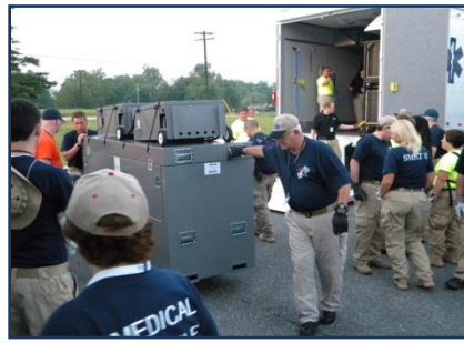
MRMRC volunteers training at the "May West" Field Training Exercise in Hendersonville.