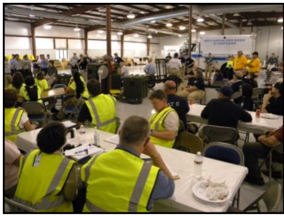
Combined agency briefing during May West FTX.